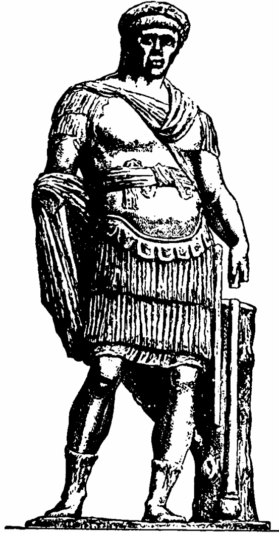
Constantine—the first “Universal Bishop of the Roman Catholic Church.

“A wonderful instance of spiritual blindness is given us in a very celebrated work of a late eminent writer, who supposes that the New Jerusalem came down from heaven when Constantine called himself a Christian! I say called himself a Christian, for I dare not affirm that he was one any more than Peter the Great. I cannot but believe that he would have come nearer the mark if he had said that it was the time when a huge cloud of infernal brimstone and smoke came up from the bottomless pit.”—John Wesley, Wesley's Sermons Vol. 2, p. 97.